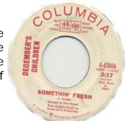
Somethin' Fresh (J. Riopell) - December's Children '66