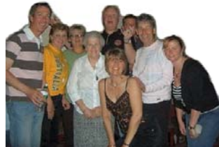
Some of the crew from Australia

Some of the other highlights for me were the record show on Sunday, which some members of the KRC were set up to run. There was also several excursions to New York City to shop, do some sightseeing and watch the Yankees play ball. The next Soultrip will be held at the end of April, 2008 in Chicago and Detroit. I hope it is as great as this one was.