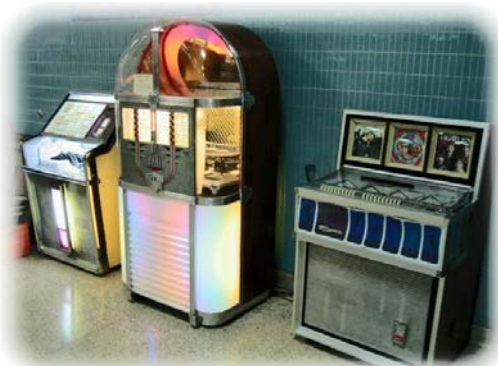
These pictures were from the November 2006 show.

You can find it all at the monthly Pennsylvania Music Expo. Of course, we have plenty of music too!