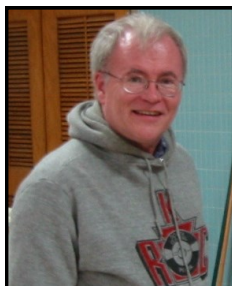
At Lancaster Catholic show, mid-1990's