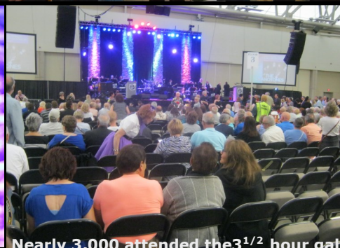
Nearly 3,000 attended the 3 1/2 hour gala