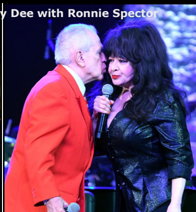
Joey Dee with Ronnie Spector