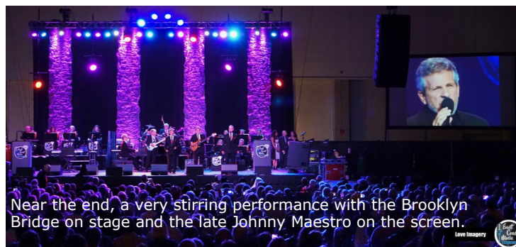
Near the end, a very stirring performance with the Brooklyn Bridge on stage and the late Johnny Maestro on the screen.