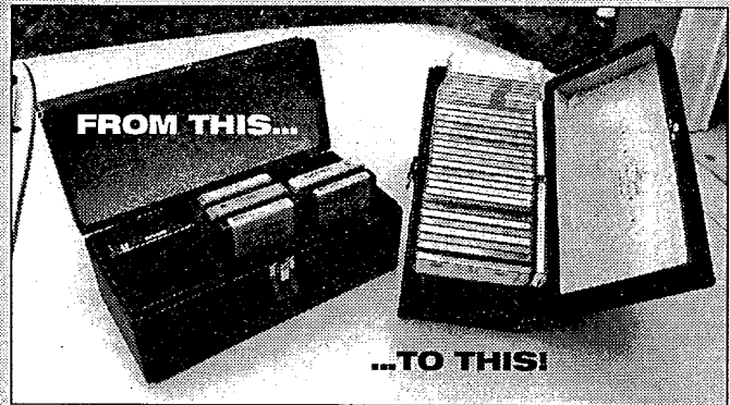
BREAKTHROUGH DISCOVERY! Those old 8-track cases are recyclable! All you do is convert the one on the left by pulling out the inside liner and presto... you have a new carrying case for at least 30 jewel boxed CDs!

Our best promotion comes by word of mouth. Every member, every vendor - all of us need to take the bull by the horns and tell friends, relatives, neighbors, co-workers, etc. about our show and club. Take some flyers and put them in high traffic locations where you live. If you have media contacts, call in your favors and help get us exposure. If you aren't willing to support and help your club promote our product (the PA Music Expo), then I suggest you pay higher freight and do a promoter run, profit-driven show. I'm sure they'll gladly take your money.