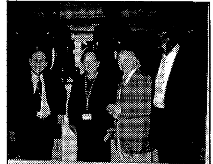
Photo # 3 - (L to R) Tim Hauser, Manhattan Transfer; Al Jardine, Beach Boys; Tony Butala, Lettermen; Warren "Birdland" Suttles, Ravens.

All of the celebrities were extremely cordial and very accessible during the time prior to the actual ceremonies. Each interview could be an article of its own, so I have chosen to include only some noteworthy quotes regarding the photos included in this article. (See the flip side.)