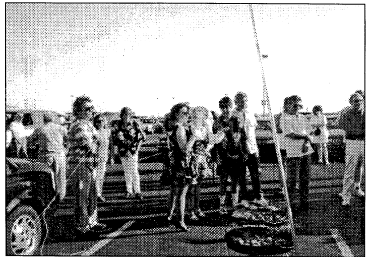
Doo-wop fans listen intently in the parking lot.