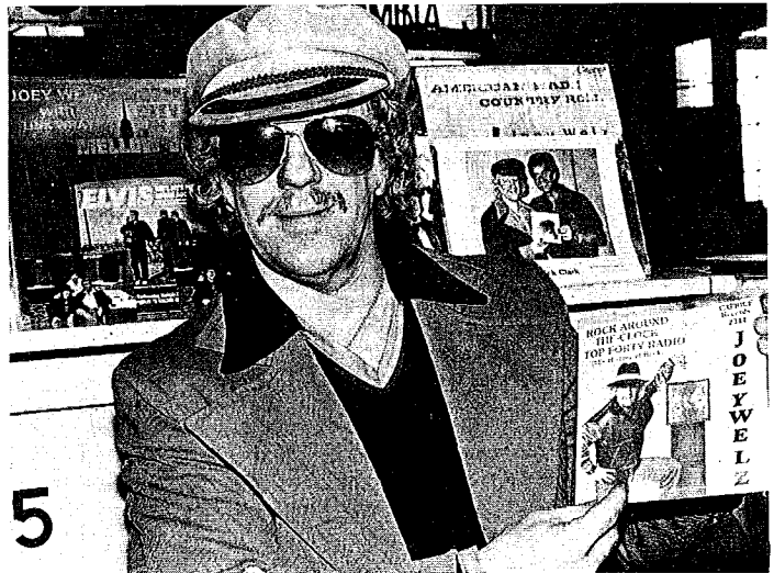
The Living Legend lives. (Space #75)