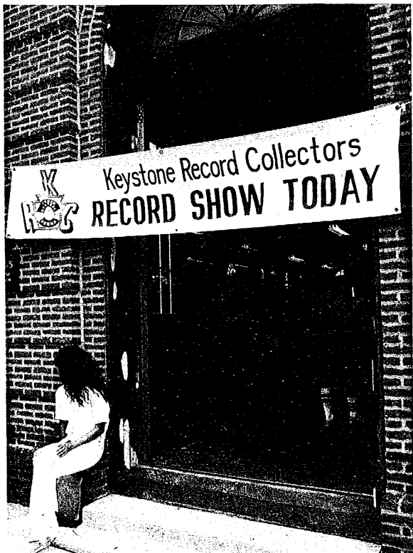
TAKING A BREATHER: The action's so fast and furious at KRC shows, sometimes you need to come outside for a rest. Our final three shows for the year take place October 14, November 11 and December 9. Hope to see you on the inside!